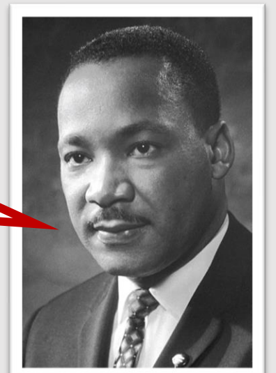
Martin Luther King Jr minister and activist

Philanthropy is commendable, but it must not cause the philanthropist to overlook the circumstances of economic injustice which make philanthropy necessary.