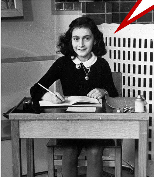
Anne Frank diarist

The smallest good deed is better than the grandest good intention.